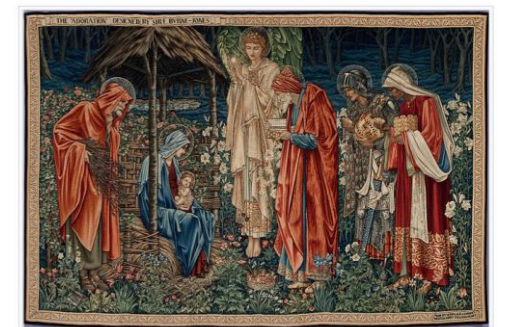
The Adoration of the Magi by Edward Burne-Jones (1904)

Epiphany - The Epiphany season is a liturgical period which immediately follows Christmas. It begins on Epiphany Day , and ends at various points as defined by different denominations, in the Anglican church it is at the start of February. The typical liturgical color for the day of Epiphany is white, and the typical color for Epiphany season is green.