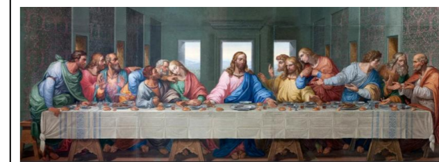
Leonardo Da Vinci's - The Last Supper

Lent is a solemn religious observance in the Christian liturgical calendar commemorating the 40 days Jesus spent fasting in the desert, according to the Gospels of Matthew, Mark and Luke. The liturgical colour is purple. Easter is a Christian festival commemorating the resurrection of Jesus from the dead, described in the New Testament as having occurred on the third day of his burial following his crucifixion by the Romans at Calvary c. 30 AD. [7][8] It is the culmination of the Passion of Jesus, preceded by Lent. Most Christians refer to the week before Easter as Holy Week, which in Western Christianity contains the days of the Easter including Maundy Thursday, commemorating the Last Supper, as well as Good Friday, commemorating the crucifixion and death of Jesus.